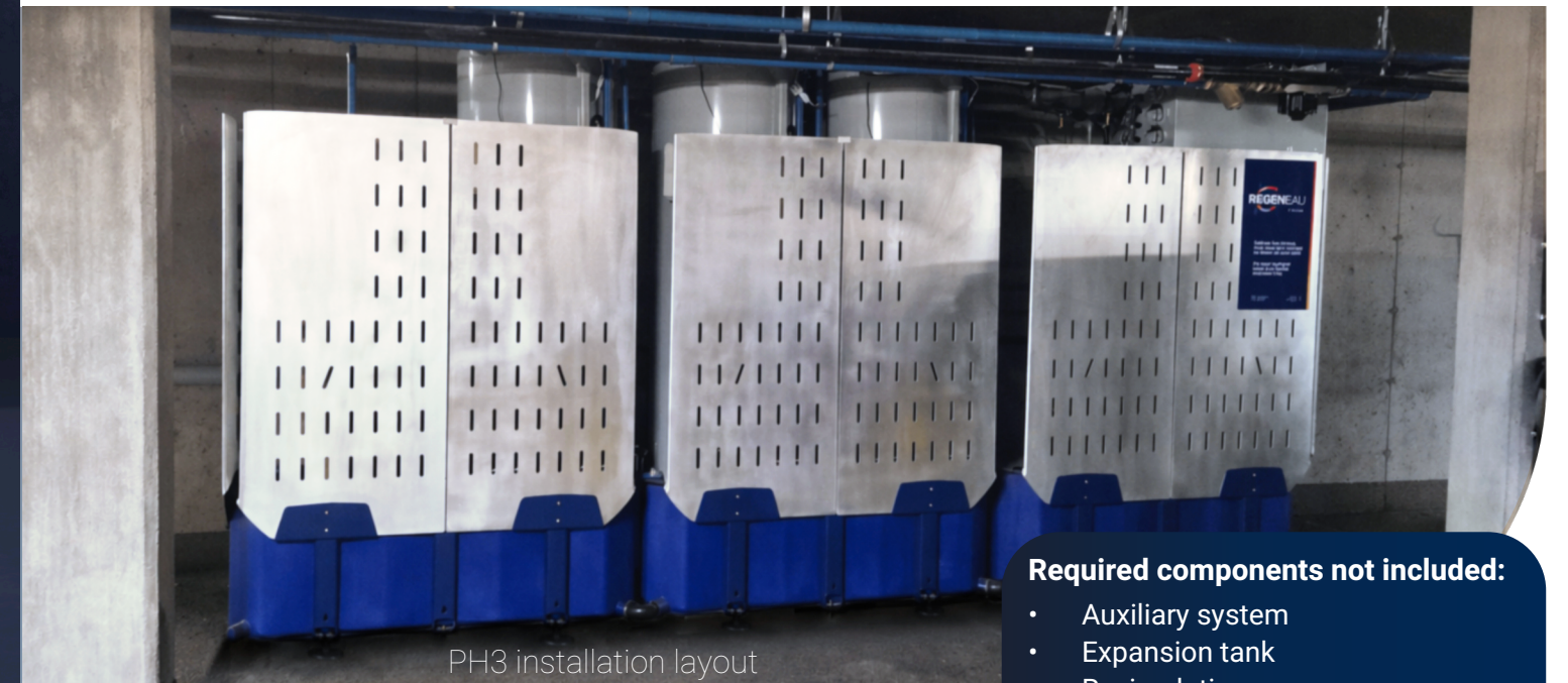
PH3 installation layout